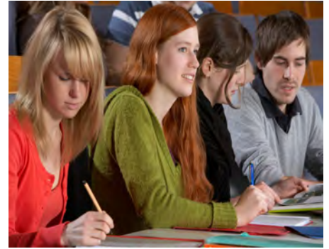
Workshops are a fun way to learn!

AABA would like to thank: The dog Wash; Bouncin Bears; Annabel’s Bargain Books and Links for sponsoring the door prizes.