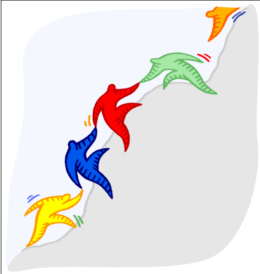
Lend a helping hand