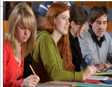
Workshops are a fun way to learn!

AABA would like to thank: The Dog Wash, Bouncin’ Bears’, Annabel’s Bargain Books, and Links for sponsoring the door prizes.